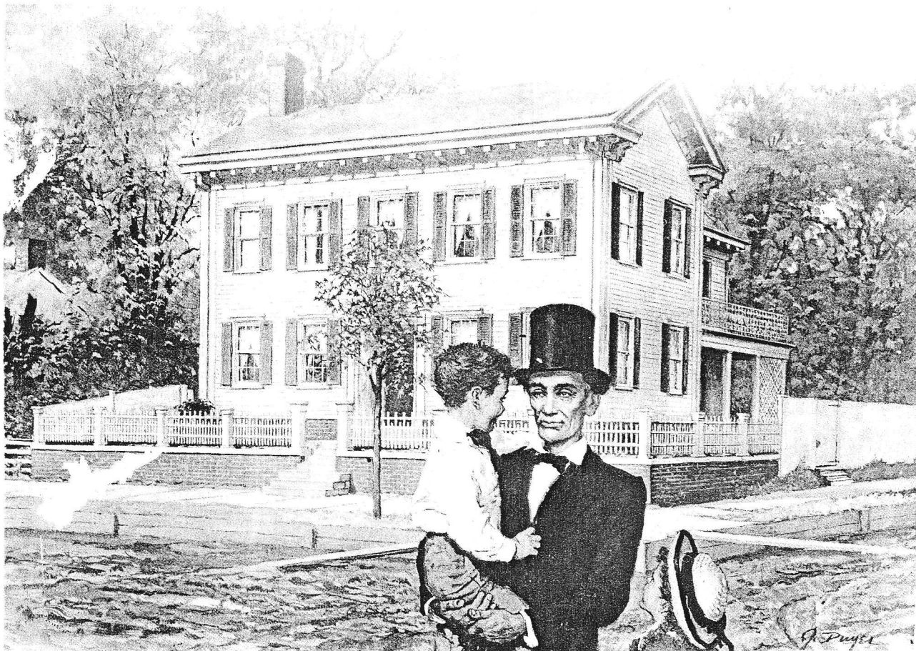
CANDIDATE FOR PRESIDENT 1860 JUST BEFORE MR. LINCOLN LEFT FOR WASHINGTON TO BECOME THE 16TH PRESIDENT OF THE UNITED STATES.