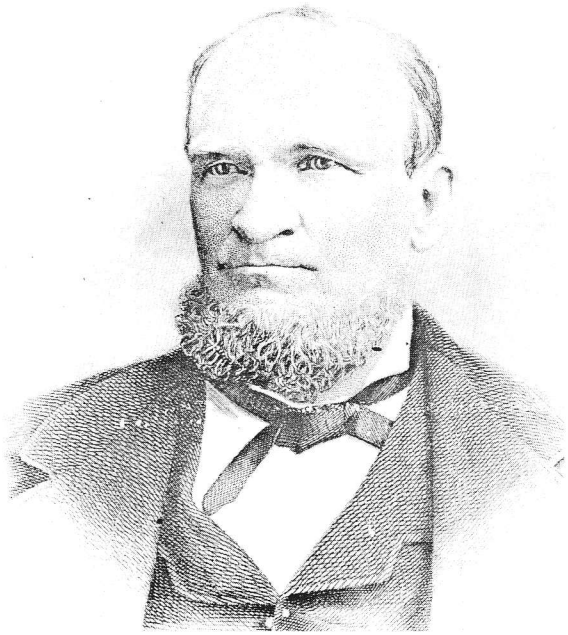
ZACHARIAH MONTGOMERY DEMOCRATIC POLITICAL LEADER