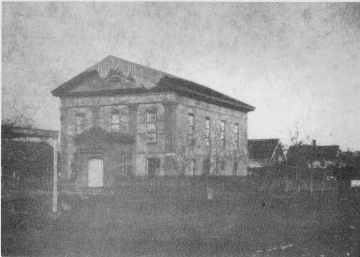
MARYSVILLE METHODIST EPISCOPAL CHURCH AT Est & 4th