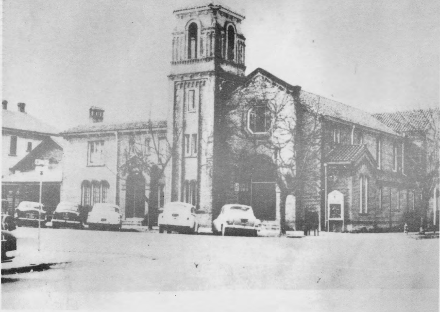
First Methodist church, erected in 1925 at 8th and D streets, Marysville.

RETURN TO THE LIBRARY OF THE MAYNARD MUSEUM 1000 UNIVERSITY AVENUE ANN ARBOR, MICHIGAN 48106