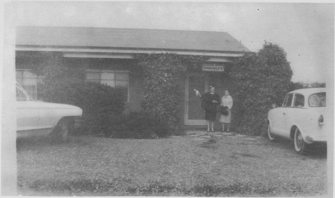
TIERRA BUENA WOMEN'S CLUBHOUSE 1963