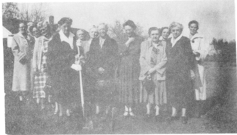
GROUND BREAKING NOVEMBER 9, 1953