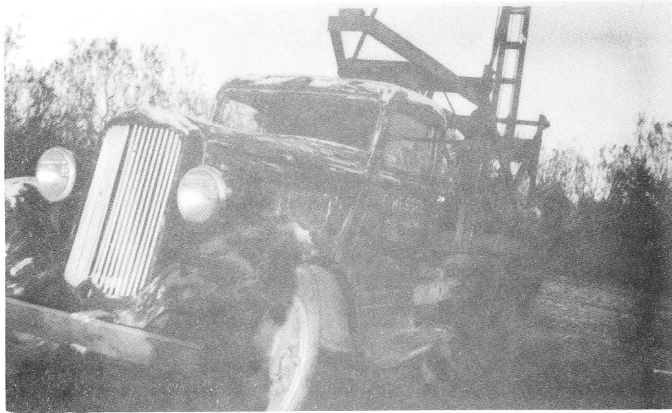
DIGGING THE WELL 1953